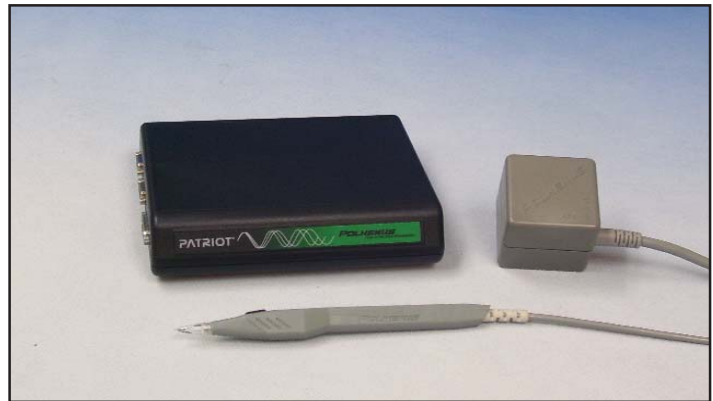
Standard PATRIOT Digitizer includes TX2 Source, 8" stylus (shown above) and foot/ band switch (as seen on the back page)

Launch directly from Rhino® and start clicking!