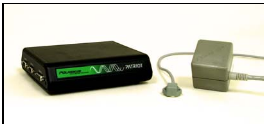
Polhemus Patriot System

The Polhemus PATRIOT™ motion tracking system is the choice for SimSpray , due to its flexibility, accuracy, and price. For industrial versions that require more tracking volume, the Polhemus LIBERTY™ system is being used. With a reputation for producing repeatable results, Polhemus motion trackers are a great fit for training and simulation applications requiring precision and consistency.