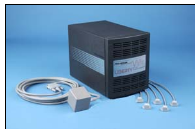
Polhemus Liberty System